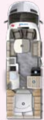
PT 726 QF