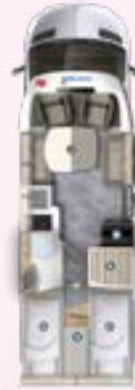
PT 726 EF