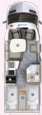
PT 696 EB